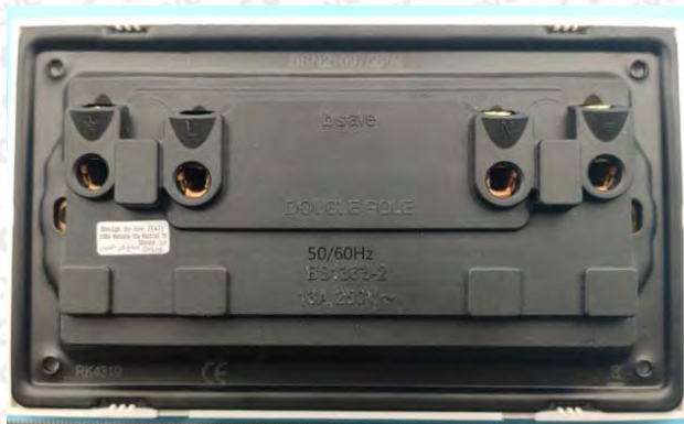
Product Marking for Representative Model BSN21097/2PN