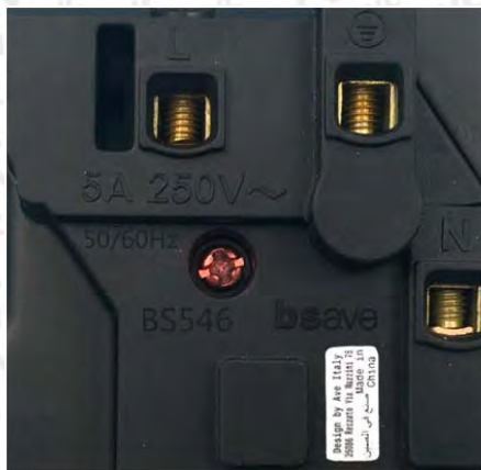
Product Marking for Models BSN11097/5A, BSN11097/15A