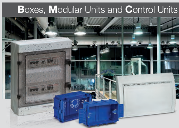
Boxes, Modular Units and Control Units